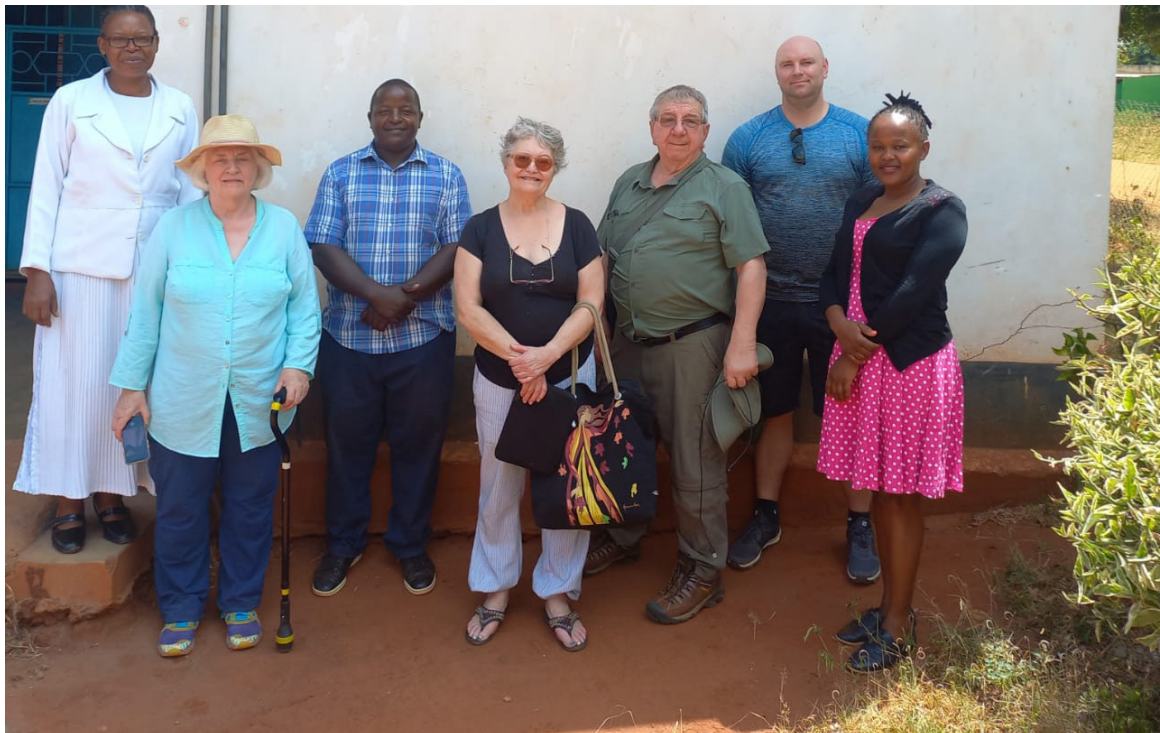
Canadian team posing for a group photo together with the team from Kinyambu Library

Kinyambu Library had the honor of hosting a team from Canada on 13th February 2023. This provided an opportunity for the library staff to showcase the available services and resources. During the visit, the Canadian team also had a chance to interact with members of the community. They appreciated the essential role that the library plays in promoting literacy and education in the area. The team expressed their admiration for the library staff's dedication and hard work, which has contributed to the growth of the library over the years.