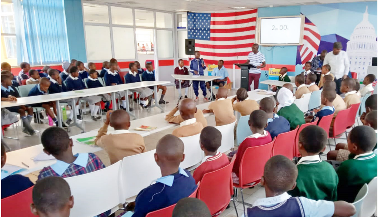
Different schools participating in the reading competition at the Nakuru Library

Nakuru in partnership with “So They Can” which is a non-profit organization, conducted a competition programme aimed at improving the spelling, vocabulary, and grammar abilities of students from six local schools. The competition, which took place on 16th February 2023, was designed to provide an engaging and interactive learning experience for students while also boosting their confidence and self-esteem.