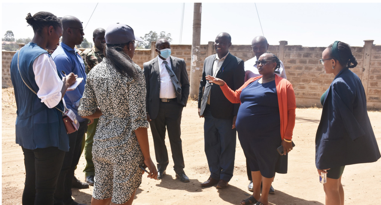
Nation Media Group Team together with KNLS staff on a site visit to KNLS plot in Ngong to assess the viability of setting up a container library

“Books don’t belong only in fancy buildings, they belong in the hands of those who seek knowledge.” KNLS in partnership with Nation Media Group, is set to launch an innovative project that will see the conversion of empty metal containers into libraries in all constituencies across the country. This move comes as a stop-gap measure to serve sub-counties and constituencies that are not currently served by KNLS.