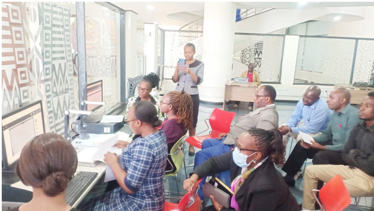
Some KNLS HQ staff following the proceedings during the training