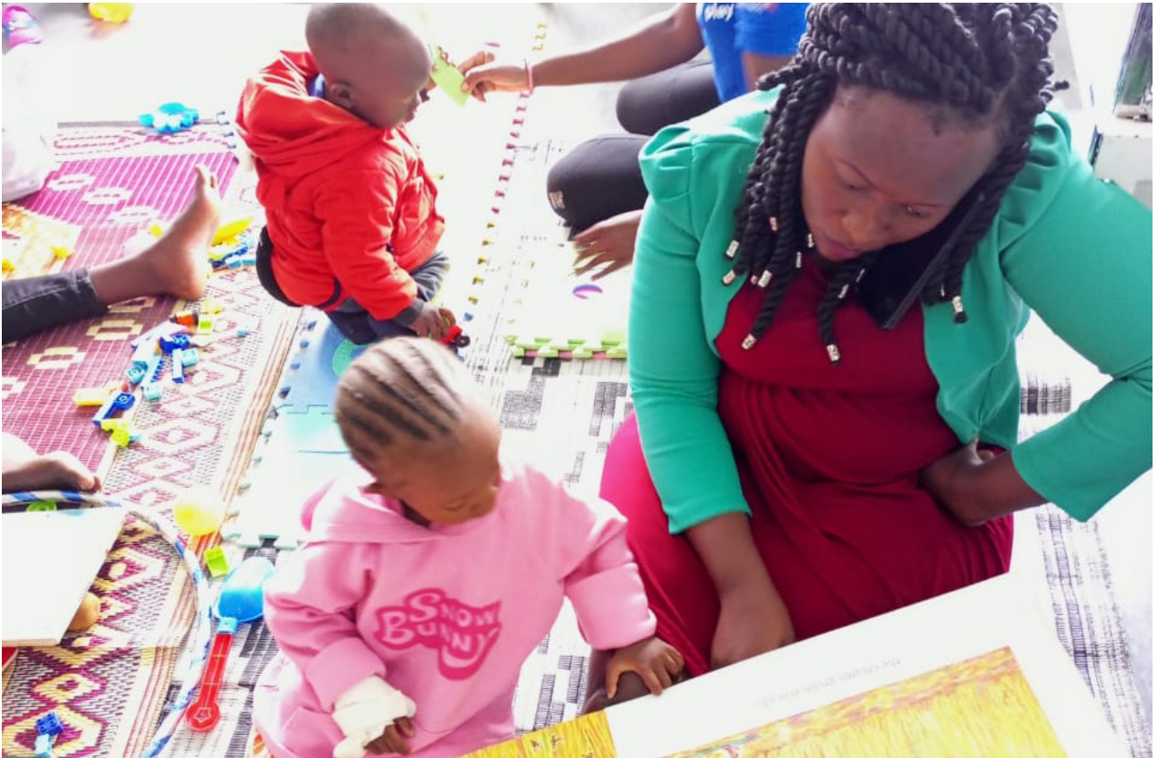
Kibera staff interacting with children at the Kenya National Hospital Childrens ward

On 16th March 2023 Kibera branch library had an opportunity to visit Kenyatta Hospital Children's ward. During the visit, the library staff conducted various learning through play activities for the children with the aim of encouraging them and making them smile despite their unfortunate circumstances. The gesture was also a way of paying back to the less fortunate in society. The targeted group included children suffering from cancer, those with optical problems, and accident victims among others. They numbered about sixty (60) in total aged between 2 to 10 years old. Learning through play helps to enhance life skills such as creativity, problem-solving, critical thinking, playing roles, leadership, improving communication skills, confidence, making new friends, and relaxing the mind.