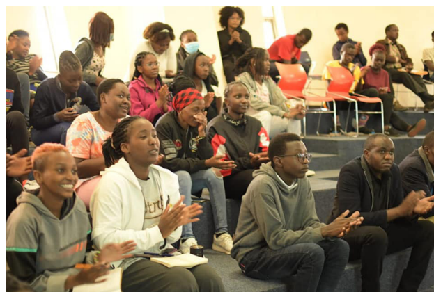
Participants following the session