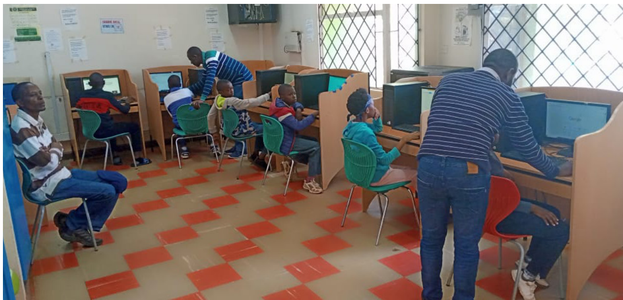
Junior library clients during the coding training sessions with their trainer at Nyeri Library

Through this initiative, the library hopes to inspire young people to become active contributors in the digital economy.