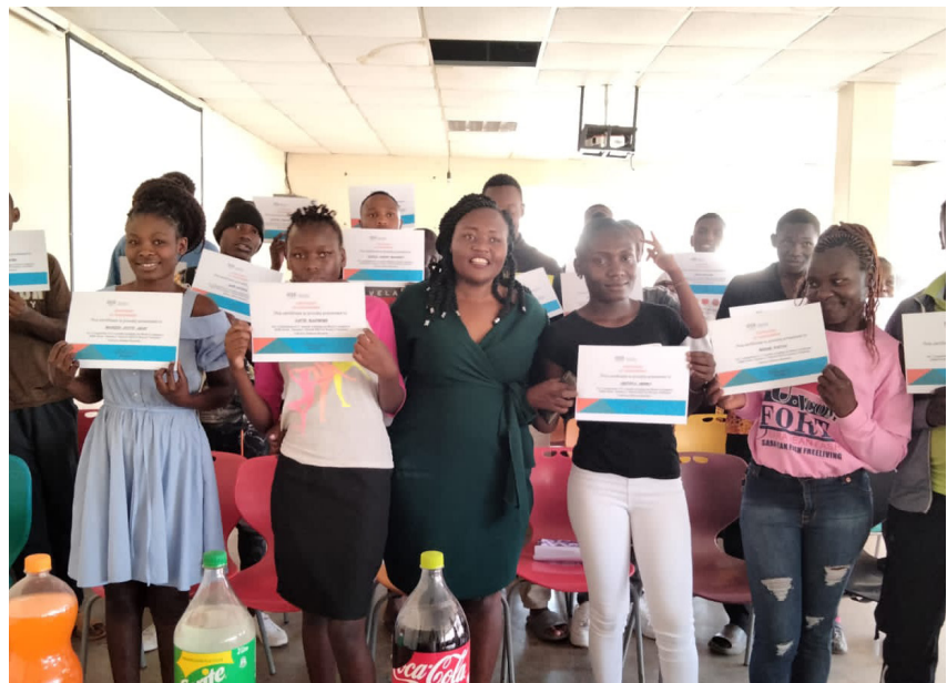
Basic ICT skills trainees displaying their certificates during the graduation ceremony

Overall, the program is an excellent opportunity for young people from the slum to gain valuable computer skills that will increase their chances of finding gainful employment in the future.