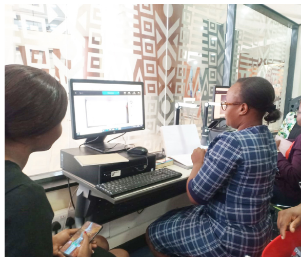
KNLS staff interacting with the software during the training

We appreciate that through collaboration and partnerships, we can achieve our goal of creating a society that is well-informed and empowered to tackle the challenges of the 21st century.