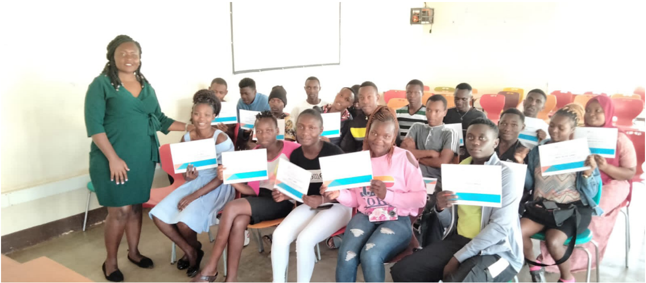
Students posing for a group photo with their trainer during the graduation ceremony

The Kibera Library provides a remarkable opportunity for young people from the slum by offering them free computer lessons that equip them with practical skills that are vital in today's job market. The program enables the youths to use various computer applications such as word processors, spreadsheet software, and graphic design tools.